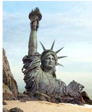
You maniacs! You blew it up!

In general, the goal of staying at or returning close to Holocene conditions seems judicious. It remains to be seen if it is practical. The Holocene never supported a civilisation of 10 billion reasonably rich people, as the Anthropocene must seek to do, and there is no proof that such a population can fit into a planetary pot so circumscribed. So it may be that a "good Anthropocene", stable and productive for humans and other species they rely on, is one in which some aspects of the Earth system's behaviour are lastingly changed. For example, the Holocene would, without human intervention, have eventually come to an end in a new ice age. Keeping the Anthropocene free of ice ages will probably strike most people as a good idea.